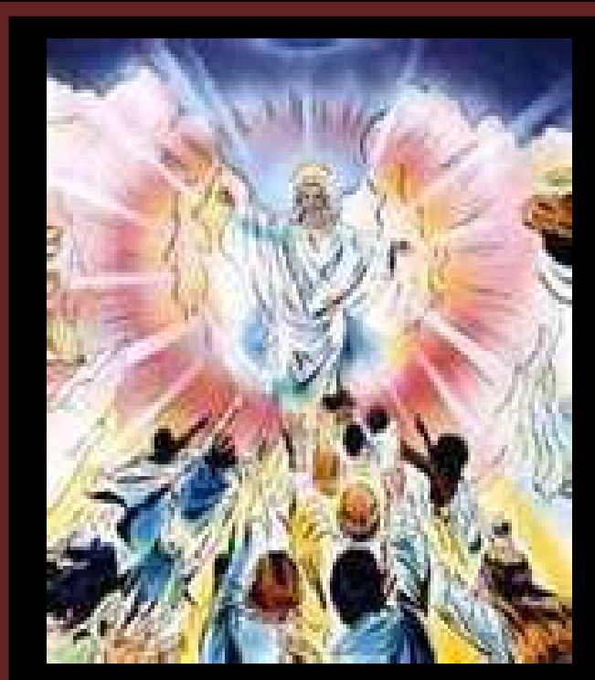
Jesus Christ is the only way back to God

The new world religion is here. You can follow any religion that you want and