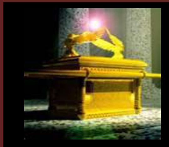
Separation between God and believers

all humans who received His blood atonement: ALL might henceforth have